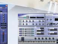
MO6/MO8 Voice Editor