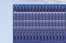
MO6/MO8 Multi Part Editor