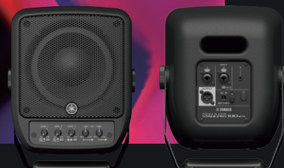
STAGEPAS 100BTR shown

Portable PA System STAGEPAS 100BTR STAGEPAS 100